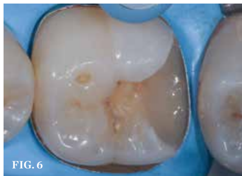
(1.) Initial radiograph. Deep distal caries extending near crest of bone. (2.) Initial access and hemostasis with viscostat clear. (3.) Caries removal endpoint and peripheral seal zone development. (4.) Matrix band placed for deep margin elevation (Garrison Margin Elevation Band). (5.) Immediate dentin sealing. (6.) Margin Elevation and resin coating completed. This is the "Bio-base."

2. Decouple with time. This protocol states that polymerization shrinkage stress to the developing dentin bond of the hybrid layer should be minimized for a certain period of time (ie 5 to 30 minutes) by keeping initial increments to a minimum thickness (ie less than 2mm). This minimal thickness prevents the connection, or "coupling," of deep dentin to enamel or superficial dentin before the hybrid layer is matured and close to full strength. This procedure neutralizes the "Hierarchy of Bondability," which states that the shrinkage of composite moves toward (or "flows" toward) the walls of the preparation that are the most mineralized and dry and flows away from the walls of the preparation that are the most moist and organic. 20,31-33