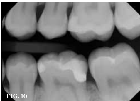
(7.) Completed margin elevation with perfect marginal seal. Mesial caries treated separately at cementation appointment. For an indirect restoration, the final impression will be taken now. (8.) Cementation appointment. Tooth is conditioned by air abrasion and phosphoric acid etching for maximum bond strength. An indirect or a chairside fabricated Inlay restoration provides maximum stress reduction and maximum bond strength. (9.) Cementation of inlay, access of mesial caries. Mesial lesion is restored separately to conserve valuable intact tooth structure. (10.) Final radiograph.