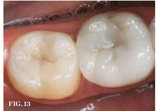
(11.) Two 15-year-old semi-direct biomimetic restorations. (12.) A 10-year-old stress-reduced direct composite restoration that included fiber placement for stress relief. (13.) These Empress inlay and Empress onlay restorations are 17 years old. Replacing occlusal and interproximal enamel, they are bonded to stress reduced bio-bases consisting of immediate dentin sealing, resin coating, and dentin replacement.

than 30 MPa. This deep margin elevation, in conjunction with immediate dentin sealing, resin coating, and the composite “dentin replacement,” is referred to as the “bio-base”—a term used by the Academy of Biomimetic Dentistry for the stress-reduced, highly bonded foundation that the indirect or semi-direct inlay or onlay will be bonded to. 50,51